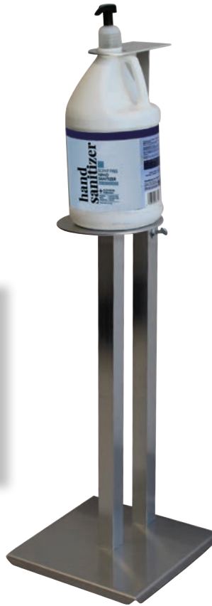
SST-24 Shown With Gallon Container