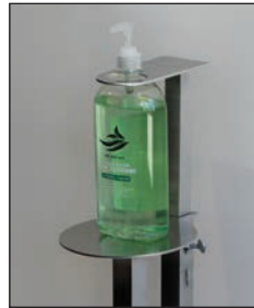
Shown Above With 15 oz. Container