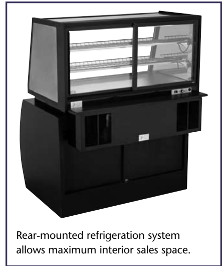
Rear-mounted refrigeration system allows maximum interior sales space.