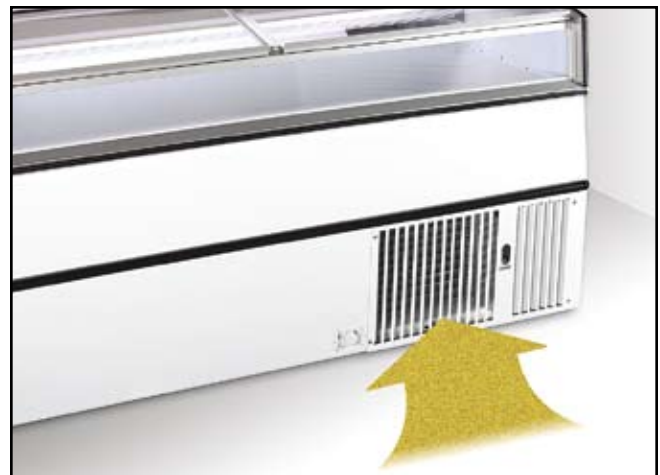
Condensers at floor level pick up a wide range of harmful debris ranging from dust to food spills to floor wax.