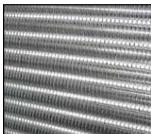
Close up of "fin style" condenser.