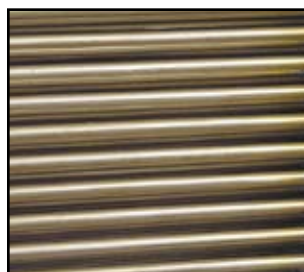
Close up of "bare tube" condenser.