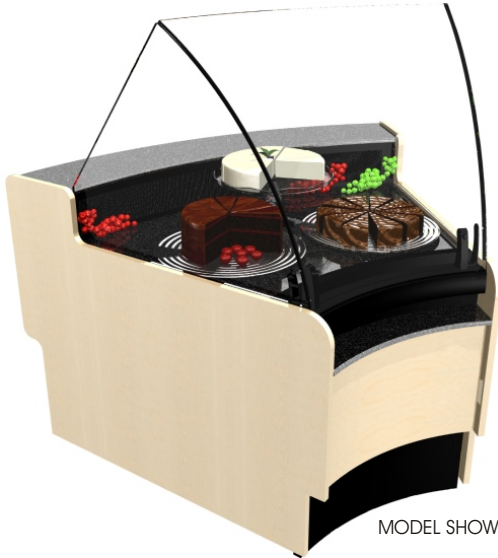
MODEL SHOWN: RTSIW45